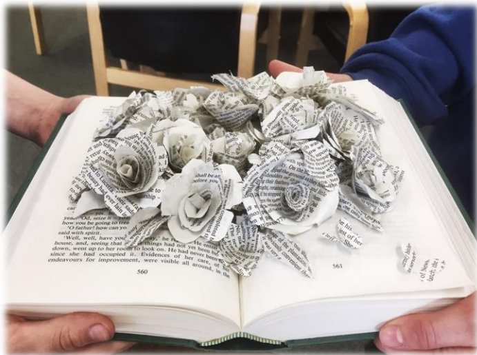
Y5 Art Project